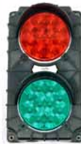
Exterior LED light display for vehicle drivers

Inside: Constant flashing red or steady green LED lights