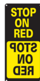
Caution signs for inside and outside the dock