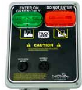
Interior LED light display for dock personnel